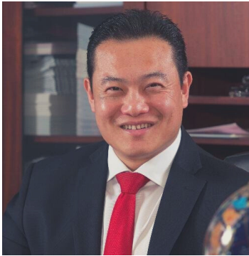
Phillip Chen Assembly District 55