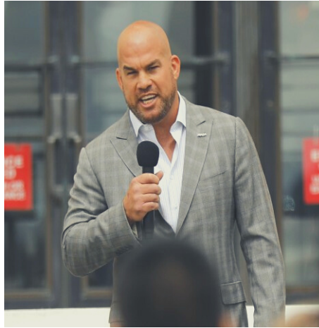
Tito Ortiz Huntington Beach City Council