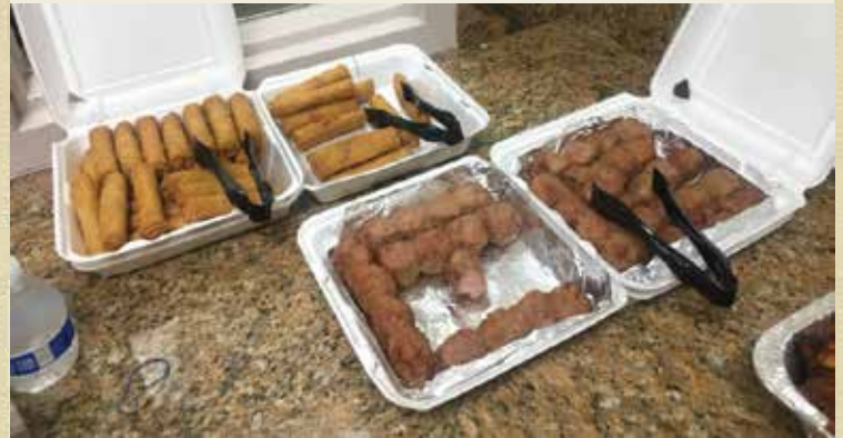
(A sneakpeak of the delicious food we had during our event)