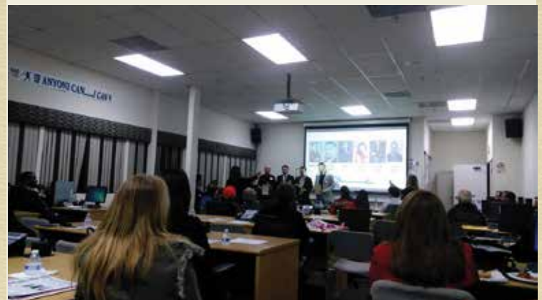
(Special thanks to Coldwell Banker George Realty for providing us with this wonderful venue)