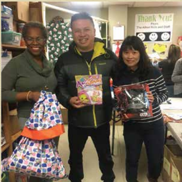
SANTA CLAUS VOLUNTEER DAY